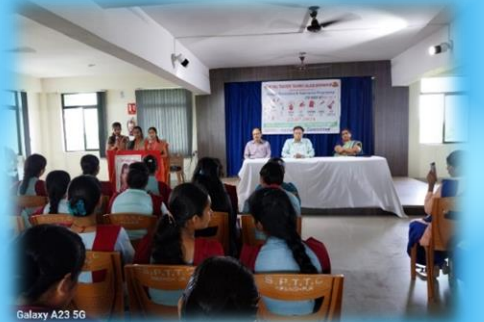
Galaxy A23 5G

addresses. She thanks the the honourable guest all faculties and non-teaching and teaching staffs who participated and arranges the programme. She also thanks to all Trainees of B.Ed. and D.El.Ed.