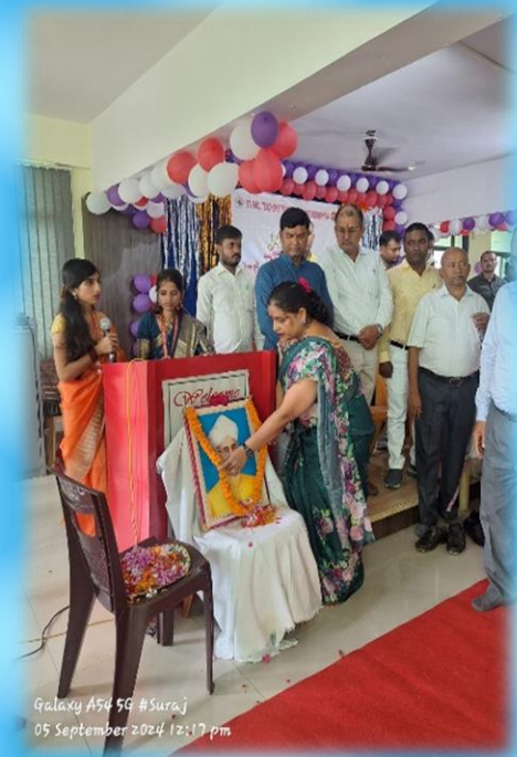
Galaxy A54 5G #Sura.j 05 September 2024 12:17 pm