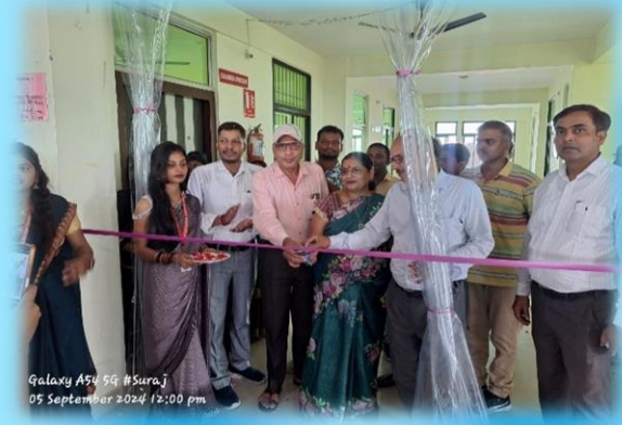
Galaxy A54 5G 05 September 2024 12:00 pm