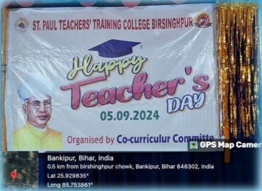
Bankipur, Bihar, India 0.5 km from birsinghpur chowk, Bankipur, Bihar 848302, India Lat 25.929835° Long 85.753861°