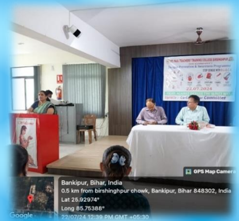
Bankipur, Bihar, India 0.5 km from birsinghpur chowk, Bankipur, Bihar 848302, India Lat 25.92974° Long 85.76388° 22/07/24 12:38 PM GMT +05:30