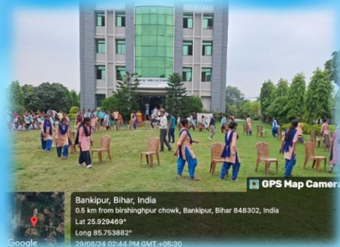
Bankipur, Bihar, India 0.5 km from birsinghpur chowk, Bankipur, Bihar 848302, India Lat 25.929469° Long 85.763882° 29/08/24 02:44 PM GMT +05:30