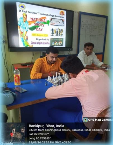
Bankipur, Bihar, India 0.5 km from birsinghpur chowk, Bankipur, Bihar 848302, India Lat 25.929857° Long 85.763813° 29/08/24 02:24 PM GMT +05:30