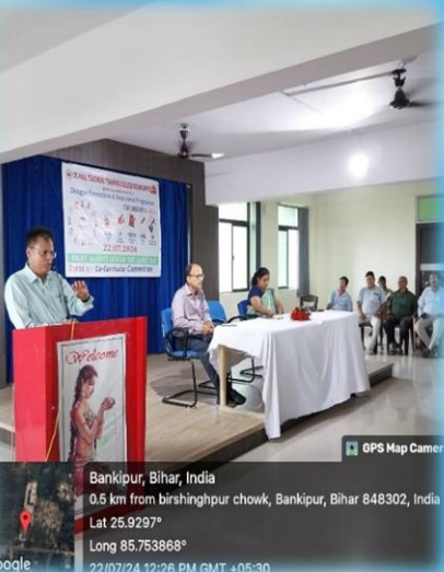
Bankipur, Bihar, India 0.5 km from birsinghpur chowk, Bankipur, Bihar 848302, India Lat 25.9297° Long 85.763868° 22/07/24 12:26 PM GMT +05:30