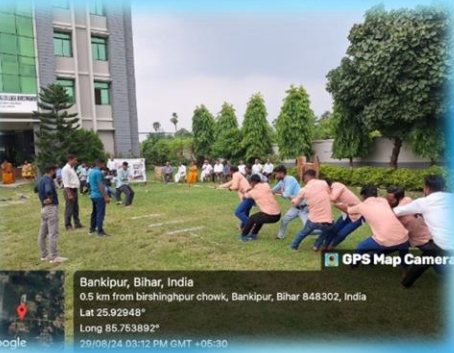
Bankipur, Bihar, India 0.5 km from birsinghpur chowk, Bankipur, Bihar 848302, India Lat 25.92948° Long 85.763892° 29/08/24 03:12 PM GMT +05:30